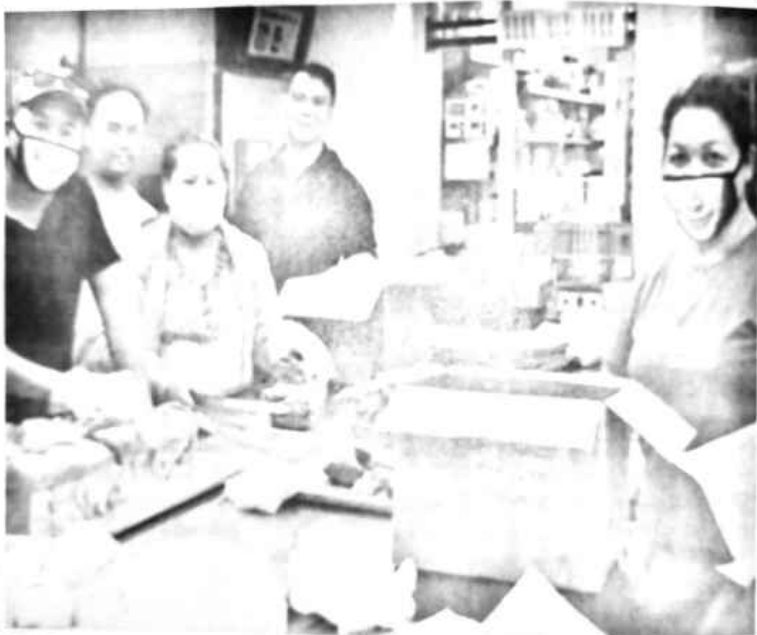
Turn to page 2 The staff at Antonio's worked round the clock to prepare meals for their neighbors in need.

According to Samudra, P15 million has been allocated to support the evacuation centers, which were put up located in Alibon and Tagaytay.